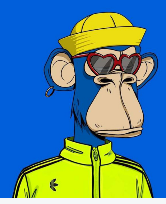
Adidas NFT project with Bored Ape Yacht Club (ape Indigo Herz)