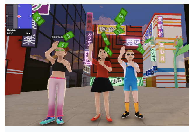
J.P. Morgan team explores Metajuku in Decentraland

One of the great possibilities of the metaverse is that it will massively expand access to the marketplace for consumers from emerging and frontier economies.