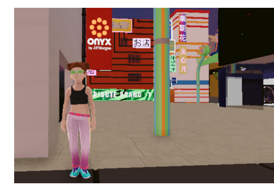
The Onyx by J.P. Morgan lounge in Decentraland

We are building and scaling new emerging technologies to modernize infrastructure and business models including but not limited to tokenization and digital identity, as we strive for perpetual innovation and better ways to organize financial transactions and payments in the decentralized web.